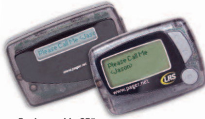
Rechargeable SP5 (NiMH)